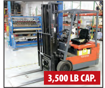
3,500 LB CAP.

ALSO AVAILABLE: DALMEC PRC INDUSTRIAL MANIPULATOR, GORBEL FREE STANDING JIB CRANE SYSTEM, LANTECH PALLET WRAPPING MACHINE, PALLET RACKING, WORK BENCHES, AND MORE