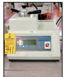
BUEHLER SIMPLIMENT AUTOMATIC MOUNTING PRESS