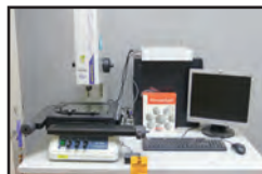
MITUTOYO QSE1020 VIDEO MEASURING SYSTEM