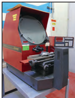
STARRETT HE400 OPTICAL COMPARATOR