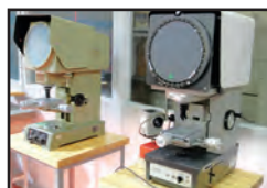
MITUTOYO OPTICAL COMPARATORS