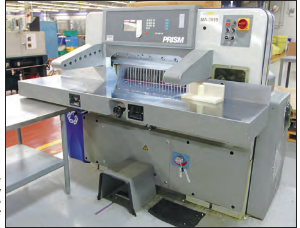
PRISM SQZK-780-NH HIGH SPEED PAPER CUTTER