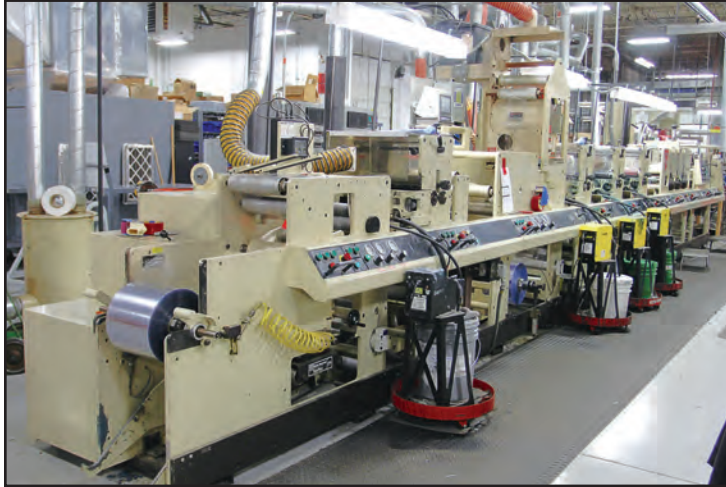
MARK ANDY 4150-10B LABEL PRINTING PRESS

Inspection: Inspection of Assets is STRICTLY BY APPOINTMENT ONLY, on Tuesday, May 22