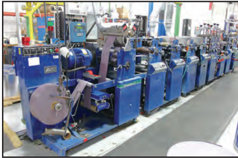
ALLIED GEAR FM3-104 FLEXOMASTER 3 LABEL PRINTING PRESS