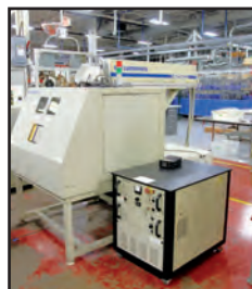
GSI LUMONICS HM1400 LASER MARKER