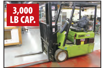
3,000 LB CAP.